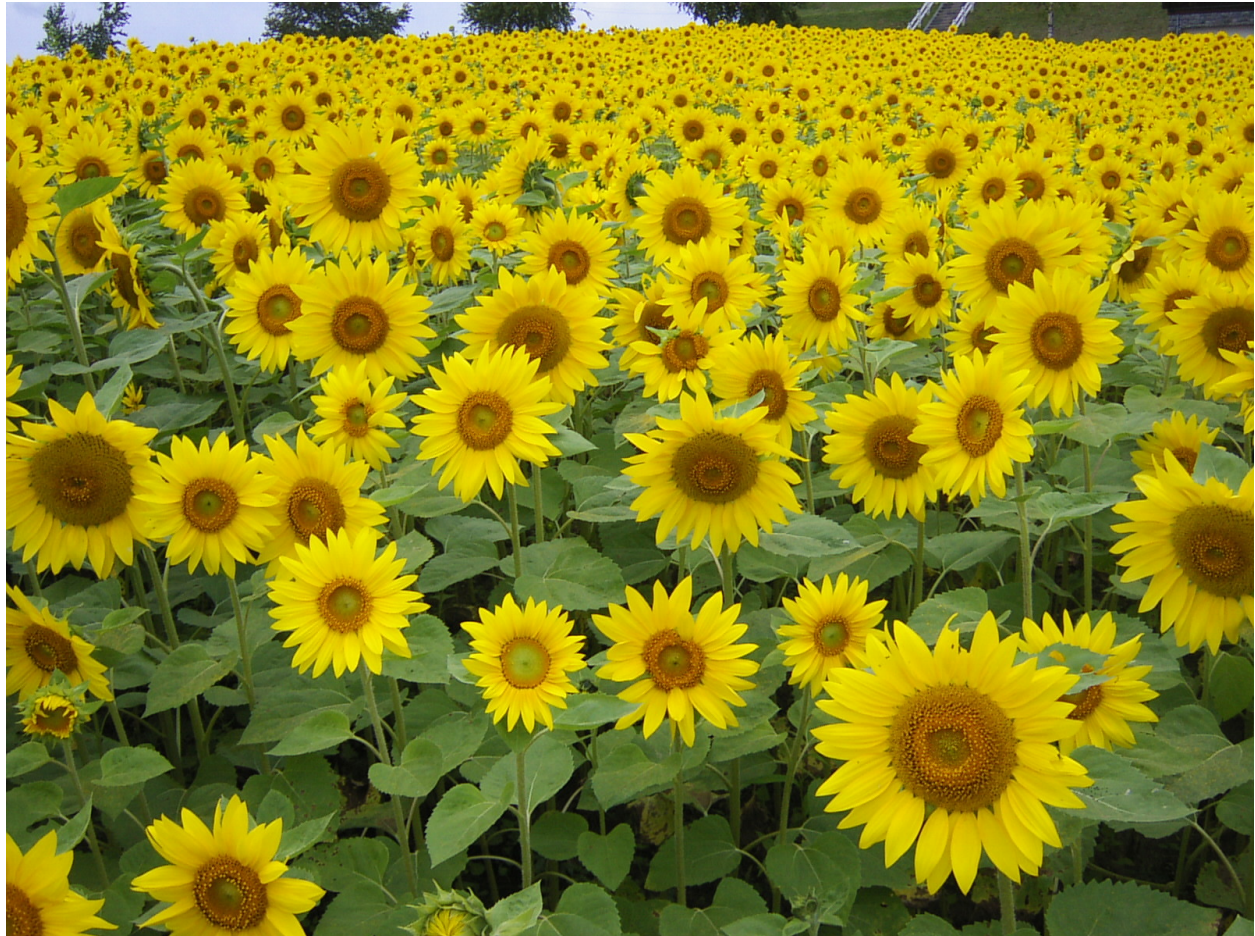
Figure 3: Creative commons licensed photograph included in wiki, http://creativecommons.org/licenses/by-sa/2.0/deed.en , Photo by KuniakiIGARASHI .

wiki. She then decided to explain one of her image choices: “My picture is also kind of like a Metaphor [sic] because it is in the ground and then grows and find [sic] out what light is and keeps growing without question. This is like how if you don't know what love is u [sic] fall in love without question even thought [sic] it might be a bumpy road” (see Figure 3).