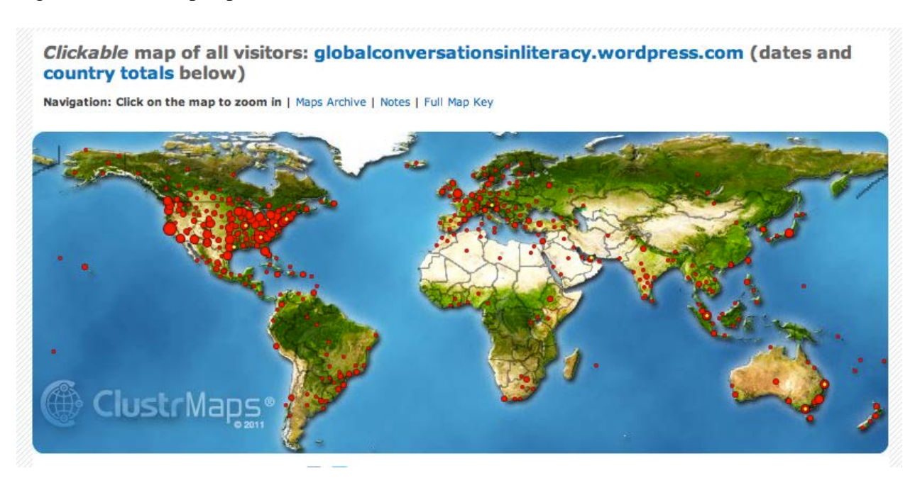
Figure 1. ClustrMap captures concentrations of interest, location, and time of access.

Figure 2. Participants engaged "in the moment" and "assembled on the spot" conversations.