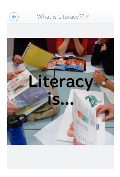
Figure 2: "What is Literacy?" Activity

coursework and the ways the apps and sites were used in class and also how they could be used with elementary students. The application of certain digital tools such as Goosechase (an online scavenger hunt) and Shadow Puppet (a video-creation tool) offered the pre-service teachers different opportunities that were aligned to authentic tasks for specific teaching purposes. Not only were they modeled, but the PSTs were given a specific task relevant to course content they needed to complete using these (and other) tools. They were also given time to reflect about these experiences and how they might be used in elementary classrooms. The PSTs were also given space to explore other self-identified digital tools and share those with one another. Figure 2 is a screen shot from a class activity that demonstrates how the PSTs' were able to multimodally define literacy. They combined using an applicable app with a meaningful task, thus having them collaborate about what it means to be literate in today's classrooms.