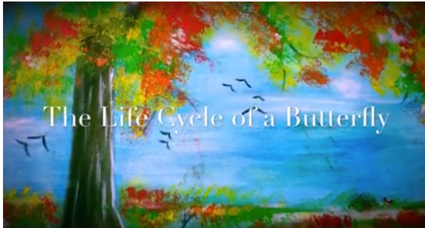
Figure 1: iMovie Example for Pre-Service Teacher

were the iMovie and the technology-integration action research project. Figure 1 is a screen shot of the iMovie Talia produced for her second-grade field placement classroom. She was able to effectively integrate technology into a literacy lesson related to a unit on the life cycle of a butterfly.