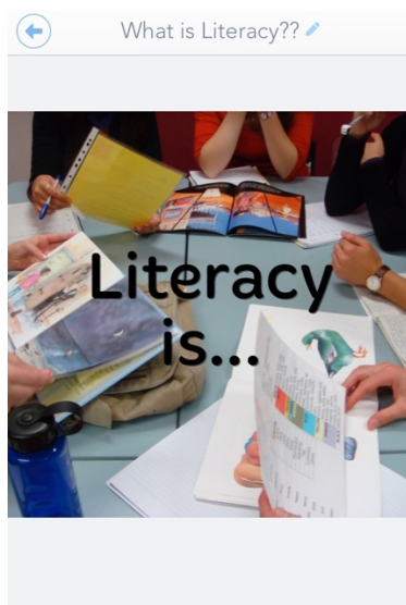
Figure 2: "What is Literacy?" Activity

coursework and the ways the apps and sites were used in class and also how they could be used with elementary students. The application of certain digital tools such as Goosechase (an online scavenger hunt) and Shadow Puppet (a video-creation tool) offered the pre-service teachers different opportunities that were aligned to authentic tasks for specific teaching purposes. Not only were they modeled, but the PSTs were given a specific task relevant to course content they needed to complete using these (and other) tools. They were also given time to reflect about these experiences and how they might be used in elementary classrooms. The PSTs were also given space to explore other self-identified digital tools and share those with one another. Figure 2 is a screen shot from a class activity that demonstrates how the PSTs' were able to multimodally define literacy. They combined using an applicable app with a meaningful task, thus having them collaborate about what it means to be literate in today's classrooms.